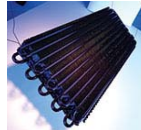
Coils that fall victim to Dirty Sock Syndrome come in all shapes and sizes and not always with a common reason for the strange occurrence.

"It's a problem unique to very hot, very humid conditions," said Debien. "In the winter in Houston, many days you'll need heat when you wake up in the morning, but by afternoon the air conditioner will be on. It's this short cycle of hot and cold that provides the perfect environment for the germs to prosper. But why did it suddenly appear when it hadn't happened before? I have a theory, with no way to prove it. Dirty Sock started appearing just about the time OEMs started using recycled aluminum in their coils instead of virgin. The belief is that the recycled is more porous and provides a kind of petri dish for bacteria growth."